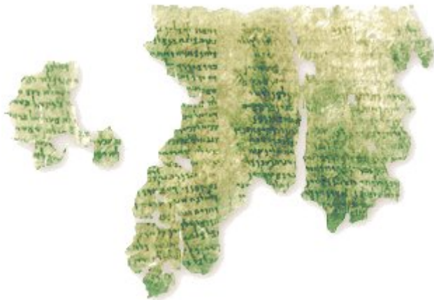
Fragment from Enoch Scroll

Chapter eight is the first mention of the title, “Son of Man” in the Apostolic Scriptures. This is a term used quite often by Yeshua when speaking of Himself. Several references in the TaNaKh make reference to the “Son of Man” in Messianic terms. Daniel 7:13 was often considered by the Sages to be referring to Messiah, and that His coming would be on the clouds. In addition, First Century hearers would have been aware of the extra-Biblical book